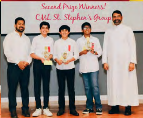
Second Prize Winners! CML St. Stephen's Group