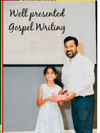
Well presented Gospel Writing