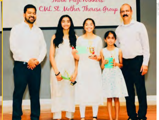
Third Prize Winners! CML St. Mother Theresa Group