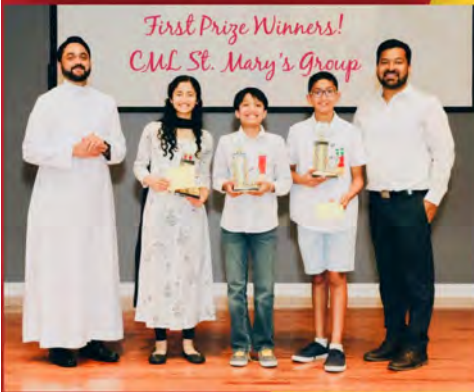
First Prize Winners! CML St. Mary's Group