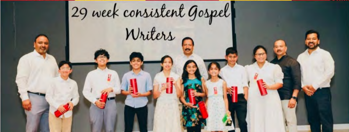
29 week consistent Gospel Writers