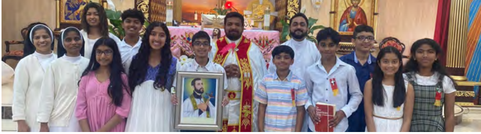
April 21st Sunday Holy Qurbana Led by CML St. Francis Xavier Group