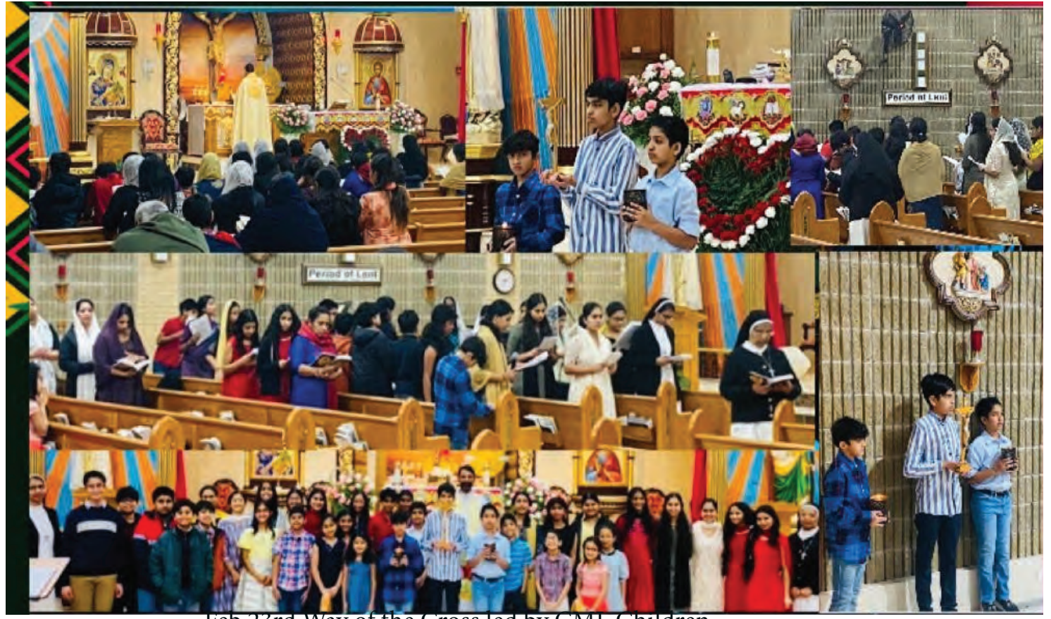
Feb 23rd Way of the Cross led by CML Children