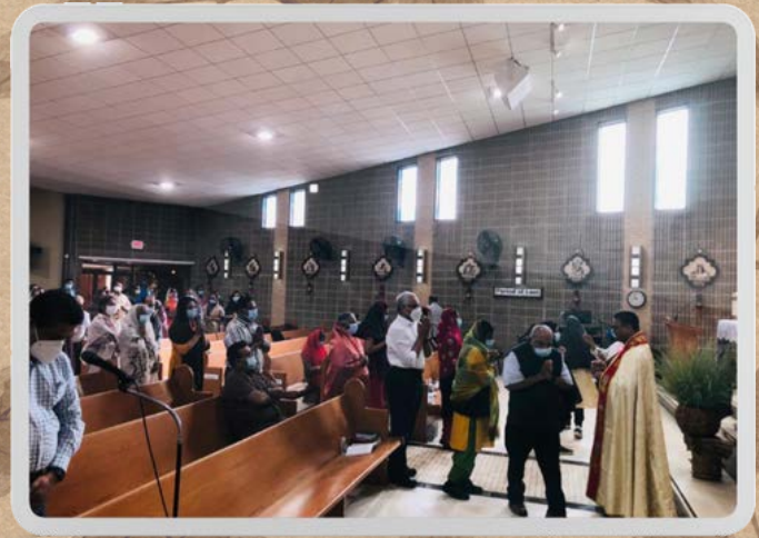
സെ.മേരീസ് ദൈവാലയത്തിൽ വിഭൂതി തിരുനാൾ ഭക്ത്യാദരപൂർവ്വം ആചരിച്ചു