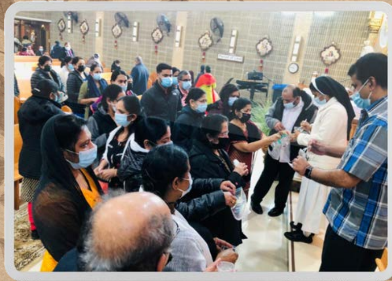
കുരുത്തോല ഭസ്മം ഭവനങ്ങളിലേക്ക് വിതരണം ചെയ്യുന്നു