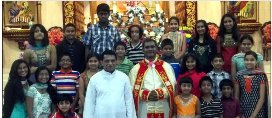
Birthday Celebratns in October after special blessings at St. Mary's.