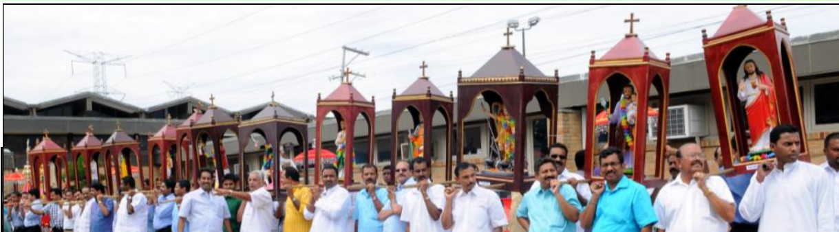
Final day photos of the Main Feast at St. Mary's Church

Sponsors: Binu & Tosmy Kaithakkathottiyil